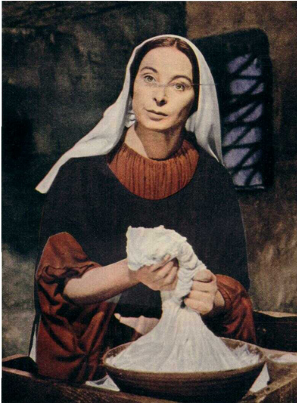
After a long search, Siobhan McKenna was cast as the Virgin Mary