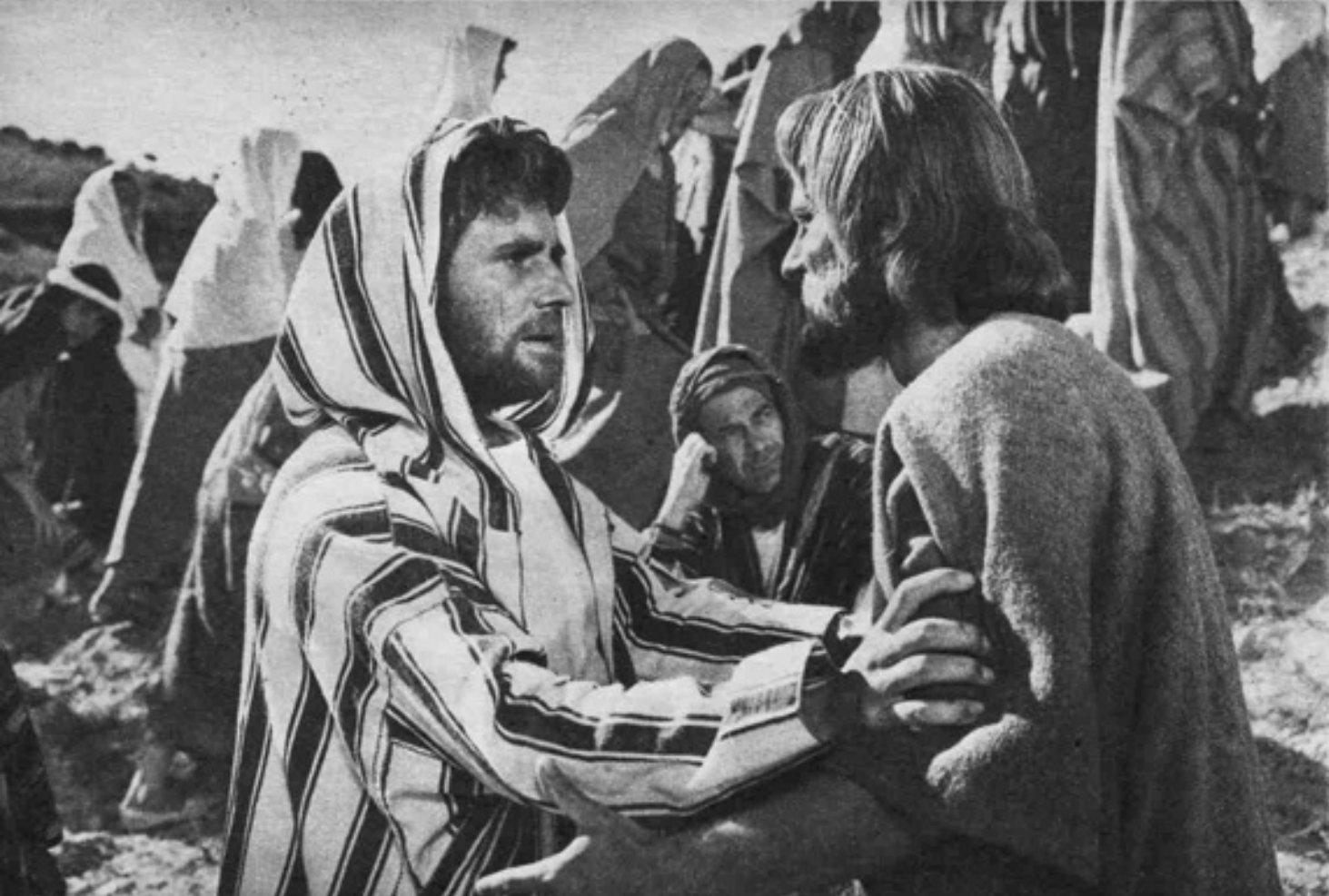
The rebel, Barabbas (Harry Guardino) meets with Judas (Rip Torn) at the Sermon on the Mount

(Continued from previous page) filmed in Spain, has cost $8,000,000 — nearly £3,000,000. No expense has been spared to make it one of the most spectacular and realistic pictures ever filmed.