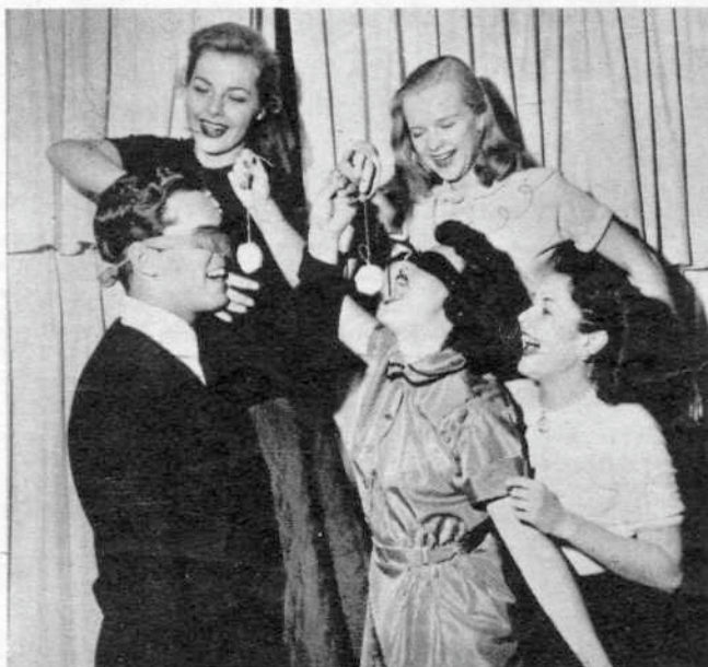
What now? Looks like peeled apples to us, but with this happy-go-lucky group one never can tell. Onions? Oh, we doubt it.