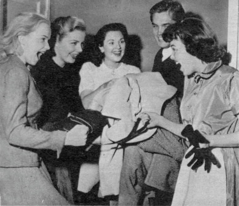
"Hey, we can't hear a thing." Everyone's talking at the same time, but we guess they're all saying how "happy they are to be here."