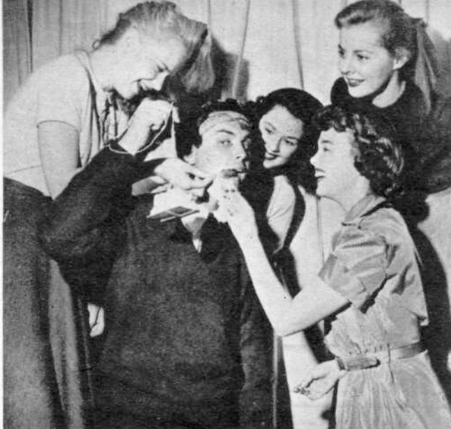
Wiping up operations start now. It's a clean-faced Jeff you'll see in 20th Century-Fox's most recent picture, "Belles On Their Toes."

What's more fun than a barrel of monkeys? Why, a party at the Jeff Hunter house . . . When Jeff and his better half, Barbara Rush, threw wide the doors for Barbara's single pals, in they rushed to turn this domicile of marital bliss into a merry madhouse . . . Poor Jeff seemed to find himself the butt of most-jokes but what man in the world wouldn't be more than willing to change places with him . . . Incidentally, there's nothing difficult about these games (?) . . . How 'bout giving them a whirl at your own next gay shindig?