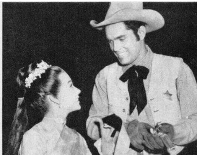
Good friend Rita Moreno visits Jeff on 20th's set of "The Proud Ones," the Western in which he is currently starring.