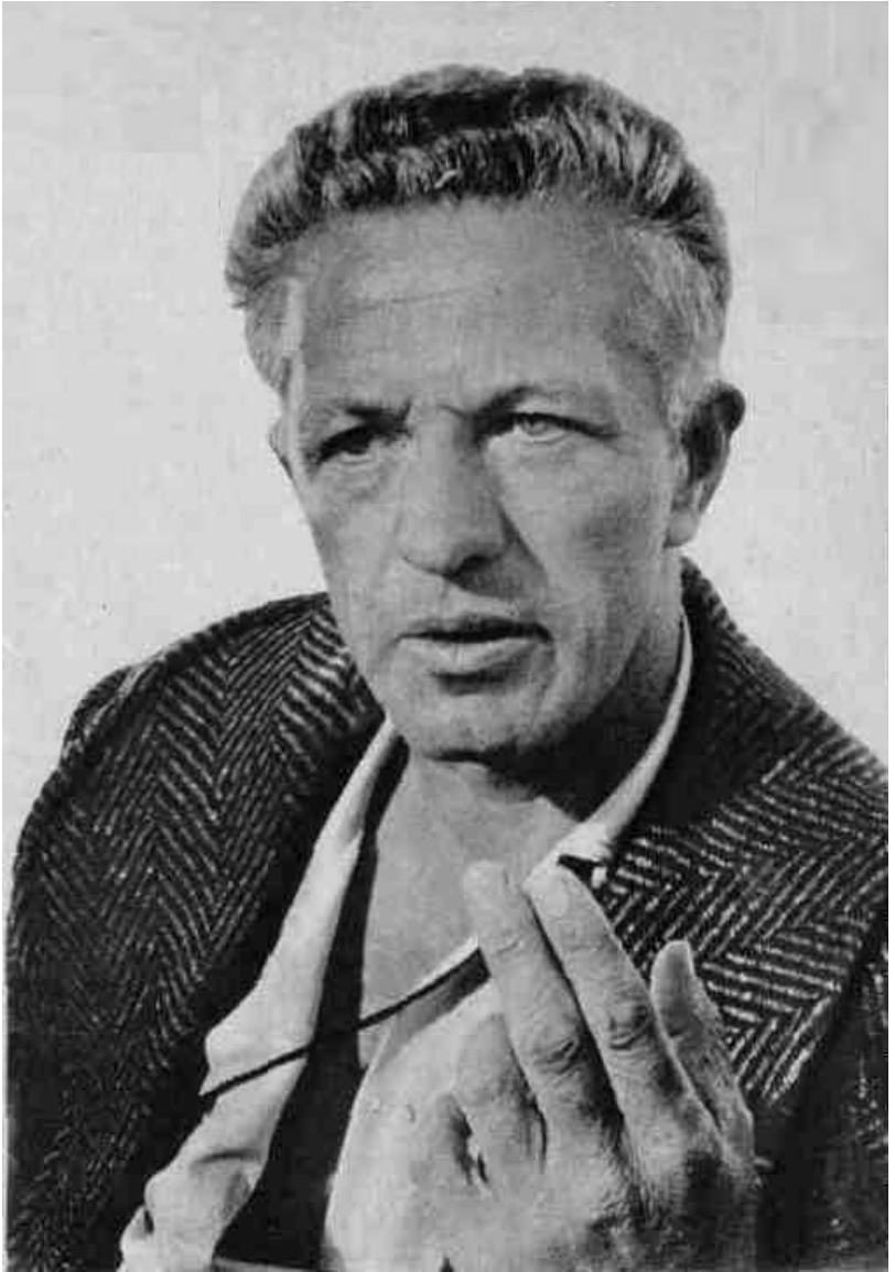
Nicholas Ray, director of "King Of Kings."

Judean revolt, but that was done to stress the conditions under which men were living—conditions which can be paralleled in modern history. The script emphasises the differing reactions to the Roman tyranny of three of its chief characters: Barabbas (Harry Guardino) and Judas (Rip Torn) fighting with physical force, and Jesus (Jeffrey Hunter) seeking a spiritual solution.