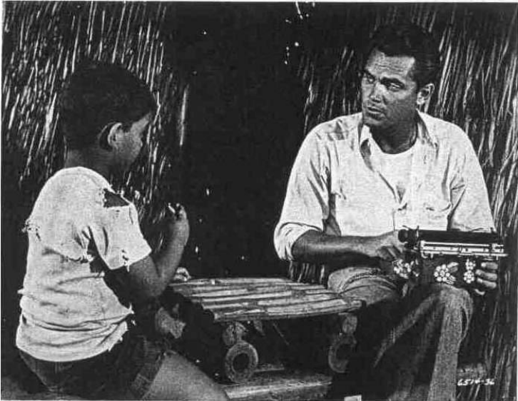
From the Universal release No Man Is An Island.

juvenile. What the major studios wanted were handsome young leading men like Hank. So nothing came of it.