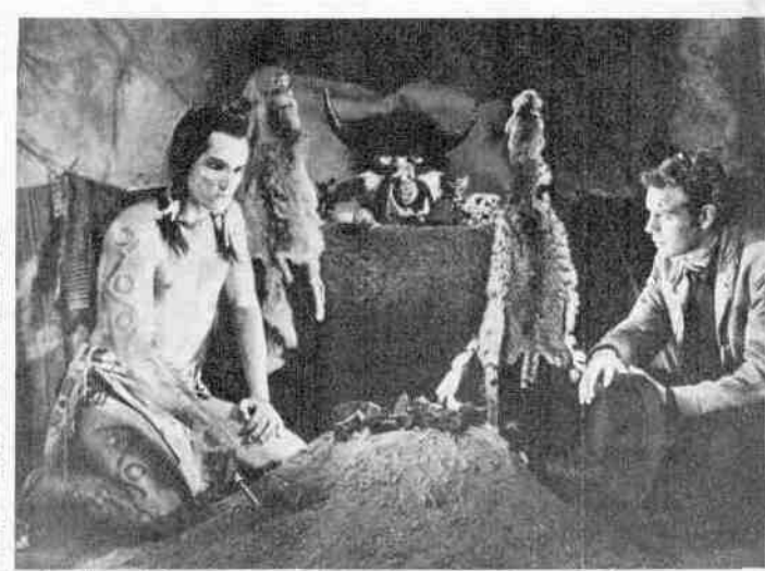
11. Hours later Appearing Day sought out Josh, imploring him to go to Little Dog, son of the chief. Josh went. He found Little Dog in the lodge of the medicine man. To his own suggestion that the south might be a better place to live, Little Dog cried, "Then let the white men go south!"