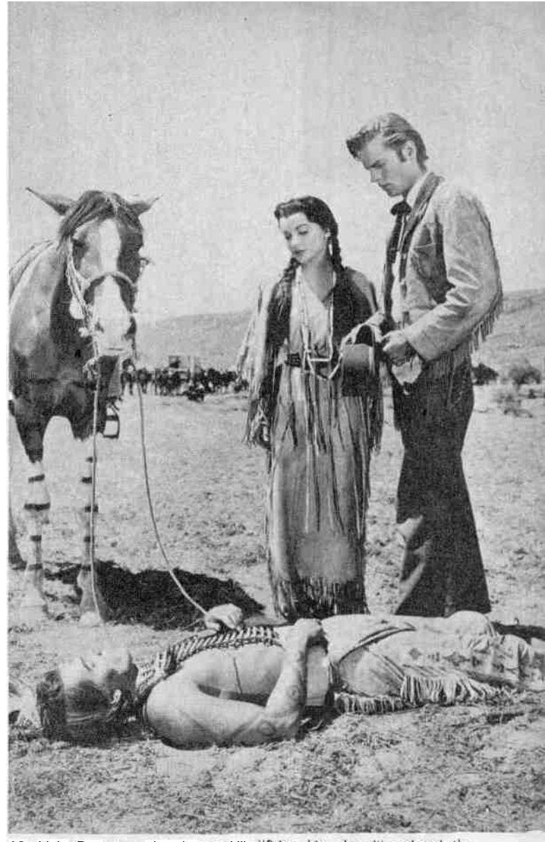
18. Little Dog was shooting to kill. "Bring him down!" ordered the Colonel, no other choice before him. Little Dog fell from his horse. Slowly, Broken Hand gave the signal and the tribe departed. Now the prospectors and ranchers could take over. And Josh could lay out his town site where the wigwams stood. The Indian wars were over.