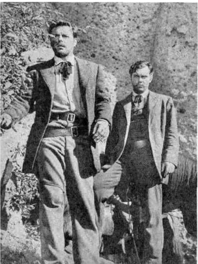
Jesse and brother Frank led two lives. In St. Joe they were upstanding citizens; elsewhere they were hunted.

first mistake—the holdup of the bank in Northfield, Minnesota—many a puzzled man across the West would have paid close to the total of all Jesse's loot to know what had made him Jesse James.