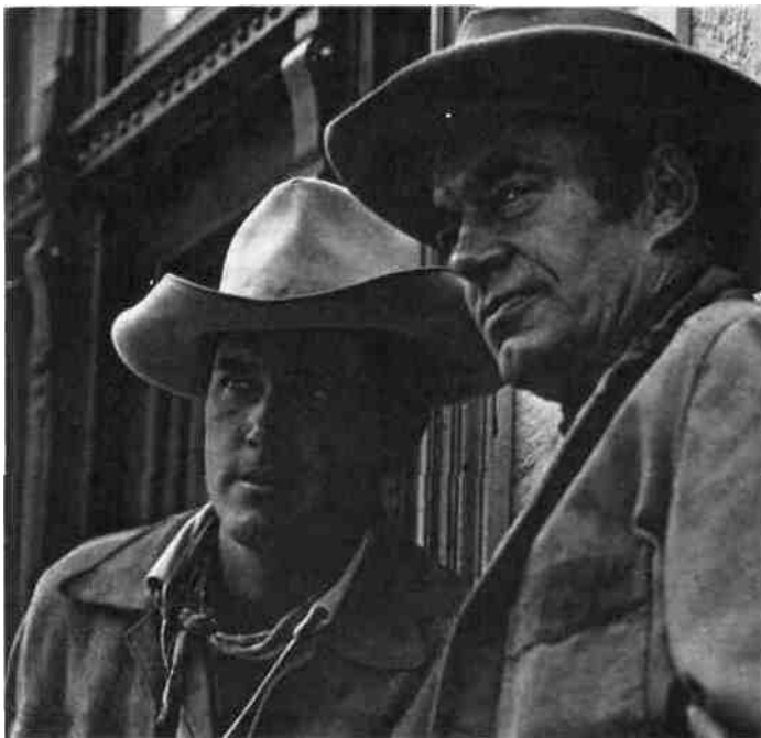
ABOVE: JEFFREY HUNTER WITH JACK ELAM IN A SCENE FROM THEIR SHORT LIVED "TEMPLE HOUSTON" TV SERIES.

like me to try that theory out on your head?", and "To start by burying you?". Captain Kirk would not have seemed like Captain Kirk saying those things. Conversely, I think that had Hunter remained with the cast that scripts would have reflected this powerful, domineering character as evidenced by Captain Pike.