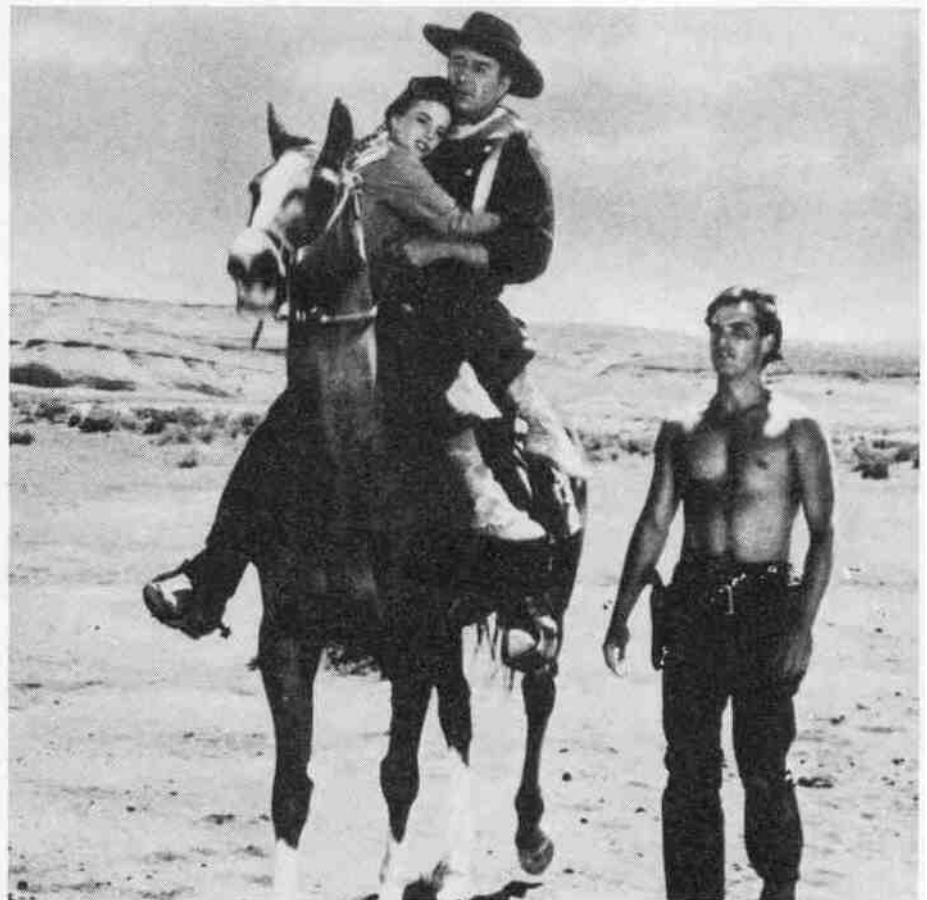
THE SEARCHERS starred John Wayne, Natalie Wood and Jeffrey. Everyone who worked with Jeff liked him. That could have been his downfall in Hollywood, because few actors are liked as well as Jeff was. His good looks and niceness worked against him in Hollywood.