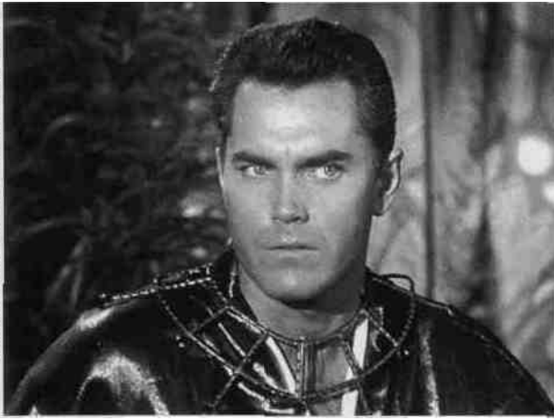
Hunter dropped out of Trek , possibly persuaded by his then-wife that an SF-TV show was beneath "a movie star."