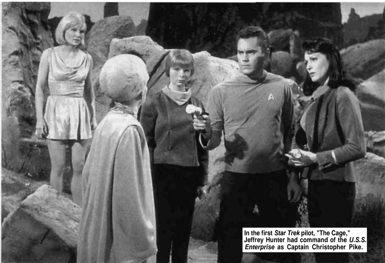
In the first Star Trek pilot, "The Cage," Jeffrey Hunter had command of the U.S.S. Enterprise as Captain Christopher Pike.

Last Hurrah and 1960's Sergeant Rutledge ) and two more for director Nicholas Ray 1957's The True Story of Jesse James and 1961's King of Kings ). His was a solid career that many actors might envy but which was, in 1964, beginning to show signs of stalling.