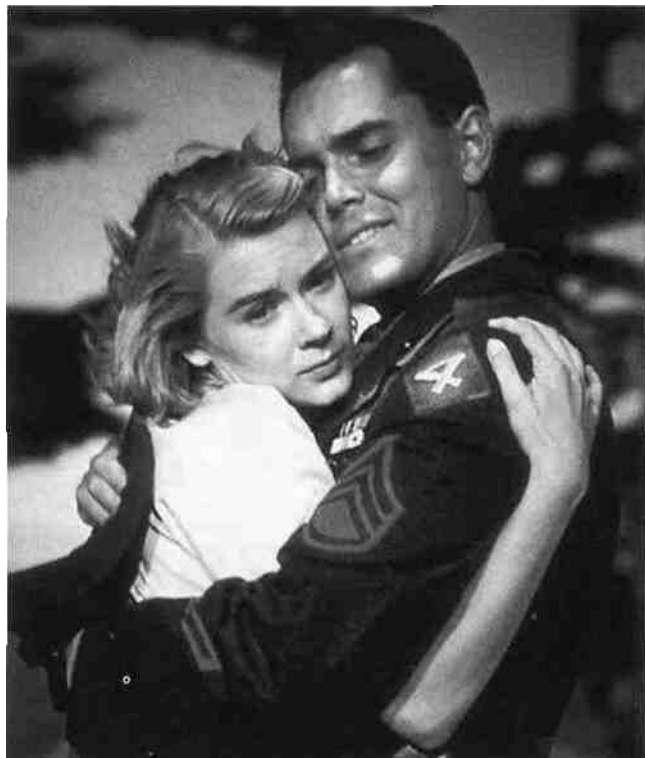
Among his other films are In Love and War (with Hope Lange), The Last Hurrah and The Longest Day .

SF buffs will note that Hunter also starred in two other genre films: Dimension 5 (1966), in which he played a time-traveling espionage agent trying to save LA from destruction, and A Witch Without a Broom (1967). In the latter, a witch falls in love with an American history professor (Hunter) and proceeds to send the two off on several misadventures through the past and future. Both movies were a long journey from the cinematic classic days of The Searchers .