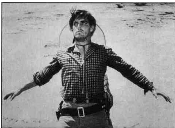
A memorable Jesus Christ in King of Kings , Hunter made Westerns like The Searchers (above) and war films before his sojourn into science fiction.

as Jesus Christ in King of Kings , his best role was undoubtedly Martin Pawley, the one-eighth Cherokee cowboy who accompanies Ethan Edwards (John Wayne) on a grim quest in The Searchers . Describing that part in the Western classic as his personal favorite. Hunter once said, "I knew I'd arrived when they gave me as many bullets as they gave John Wayne."