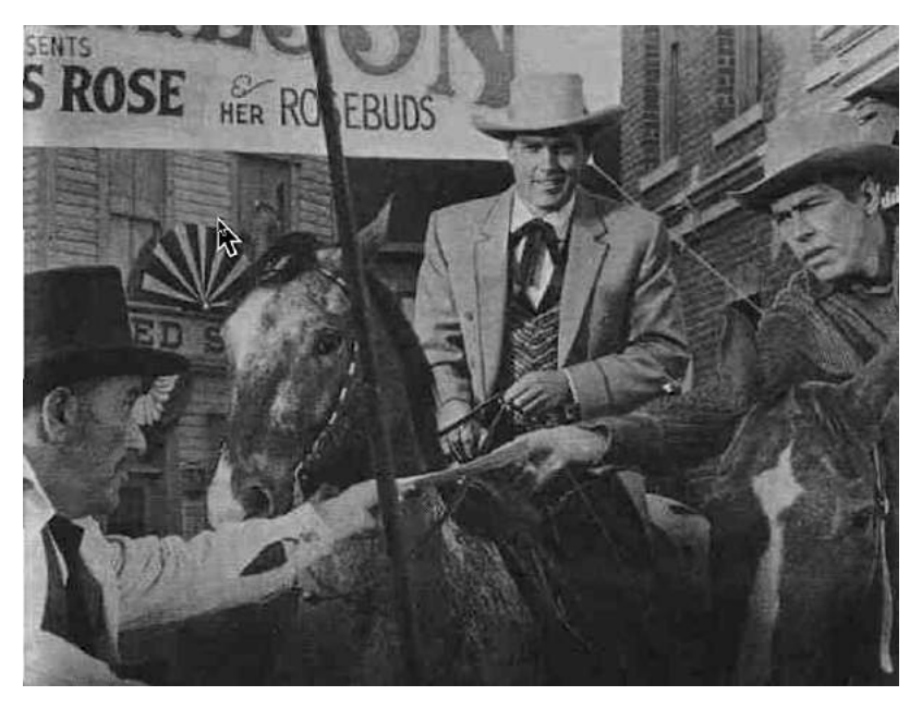
In The Man From Galveston Jeff plays a rough riding, soft spoken attorney. He does his own riding, fighting.