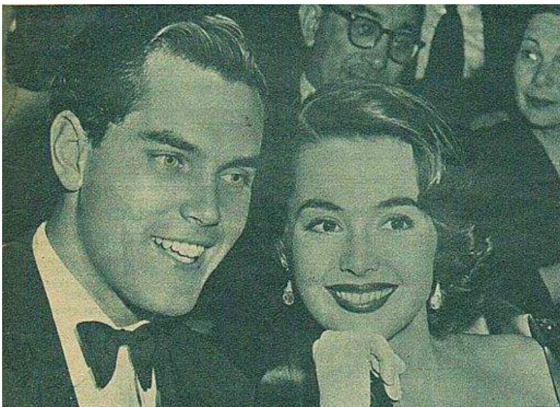
Ten years ago, Jeffrey Hunter, when he was married to Barbara Rush, seen with her during a Hollywood premiere. The marriage was not a successful one.

near the ocean. We have furniture in it that we purchased here on our last visit.