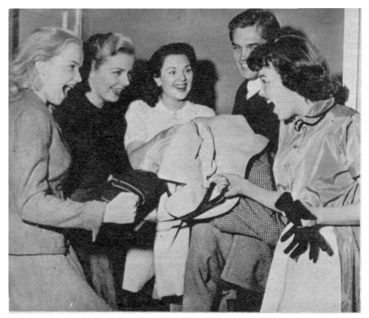
"Hey, we can't hear a thing." Everyone's talking at the same time, but we guess they're all saying how "happy they are to be here."