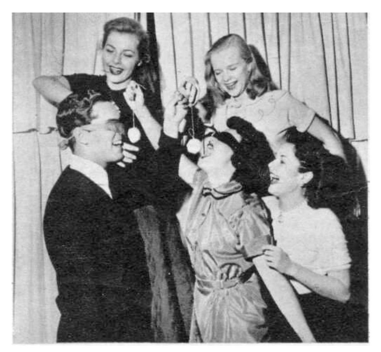
What now? Looks like peeled apples to us, but with this happy-go-lucky group one never can tell. Onions? Oh, we doubt it.