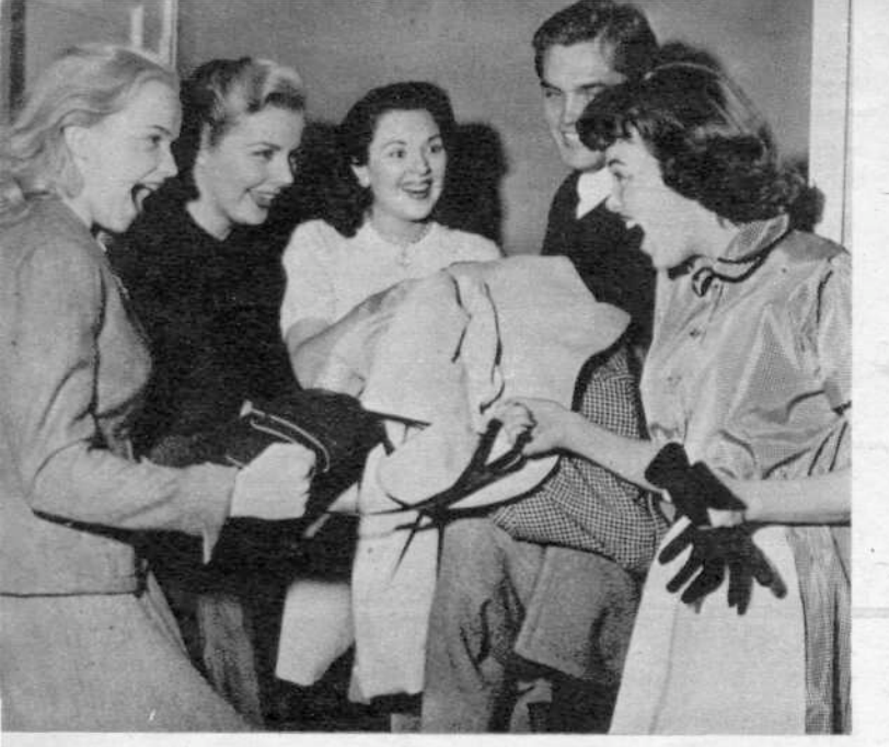
"Hey, we can't hear a thing." Everyone's talking at the same time, but we guess they're all saying how "happy they are to be here."