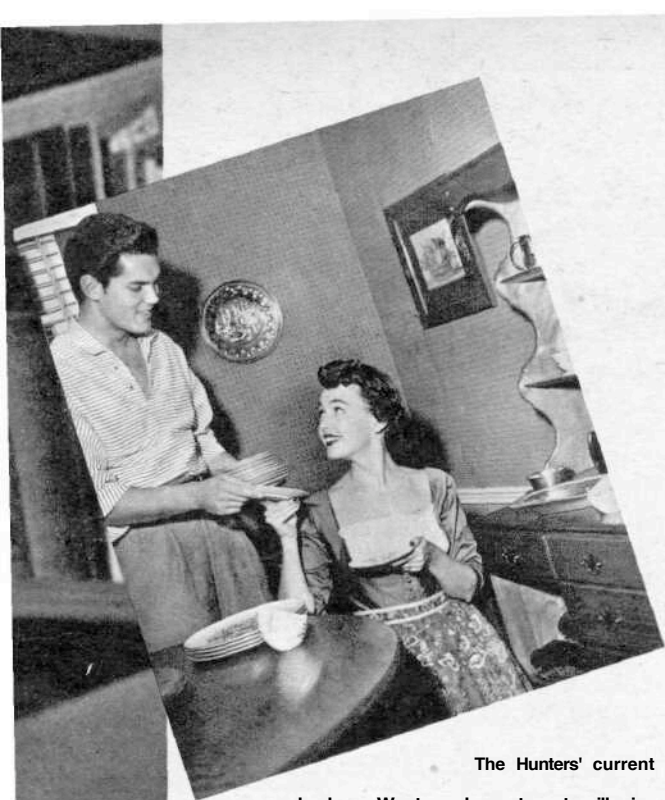
The Hunters' current abode, a Westwood apartment, will give way to their own home as soon as they can find the kind of dream house they seek.