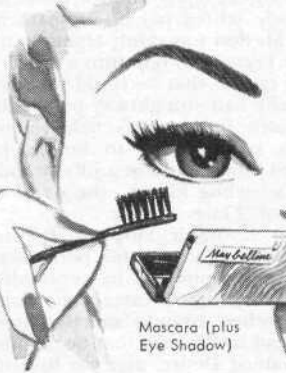
Mascara (plus Eye Shadow)