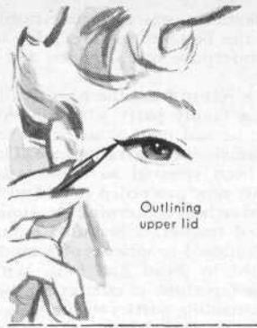
Outlining upper lid