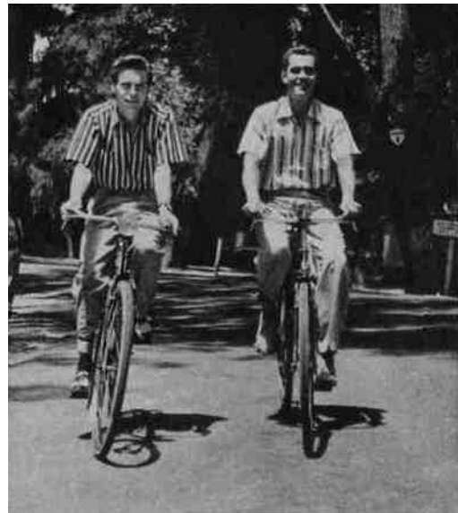
Renting bikes, they're off on their own de luxe tour