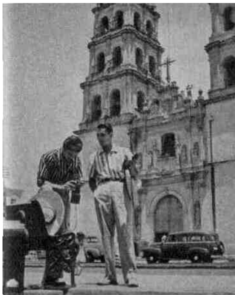
Their Rolleis get workouts as they reload for more pictures