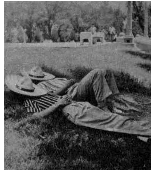
Siesta time. The end of a wonderful trip through Durango