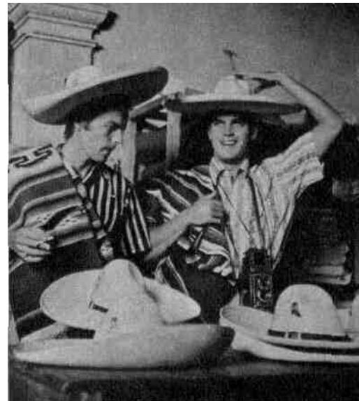
The boys go native; buy sombreros, but skip the gay sarapes