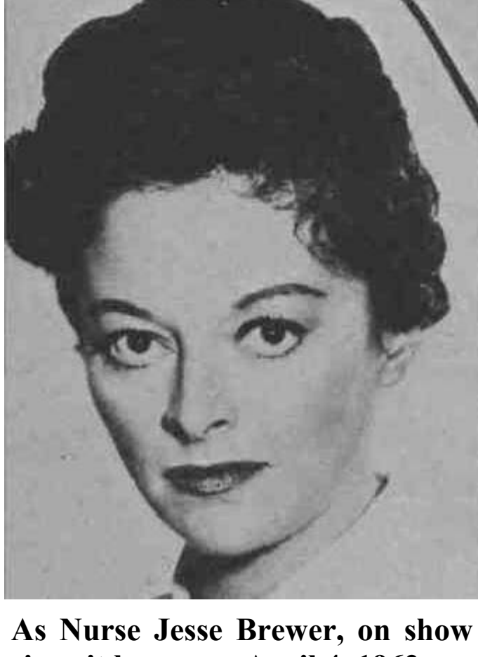
As Nurse Jesse Brewer, on show since it began on April 4, 1962.