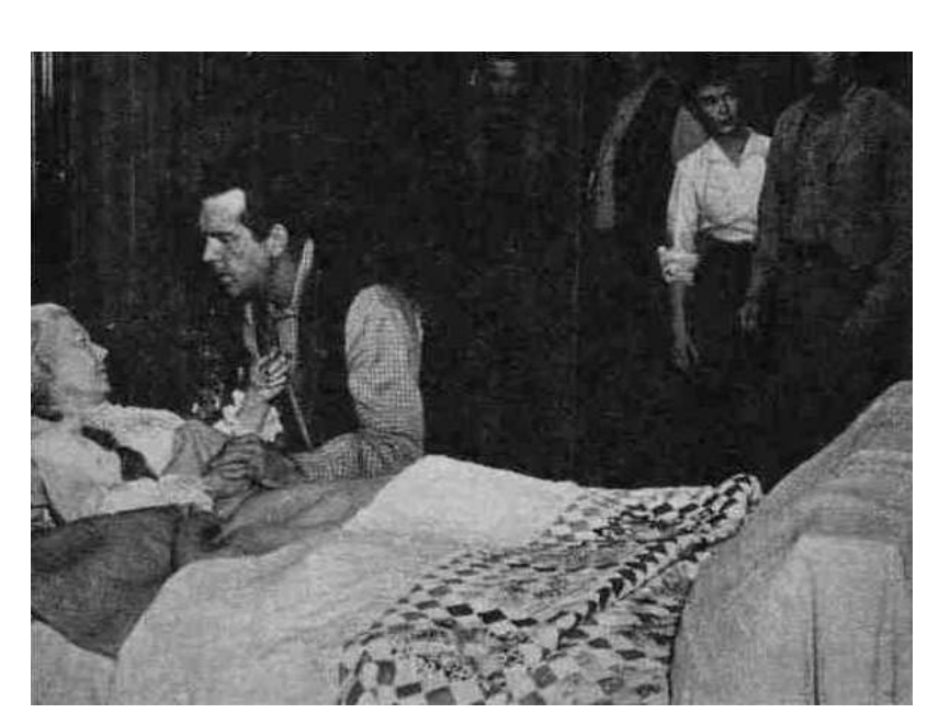
Bless was Ma's pet. Day Ma died, Will kept sayin', "I love ya, too, Ma!"

But the last she breathed to her firstborn was, "Tell Bless I couldn't wait for him."