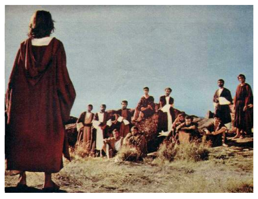
Jeffrey Hunter as Jesus Christ preaches the Sermon on the Mount