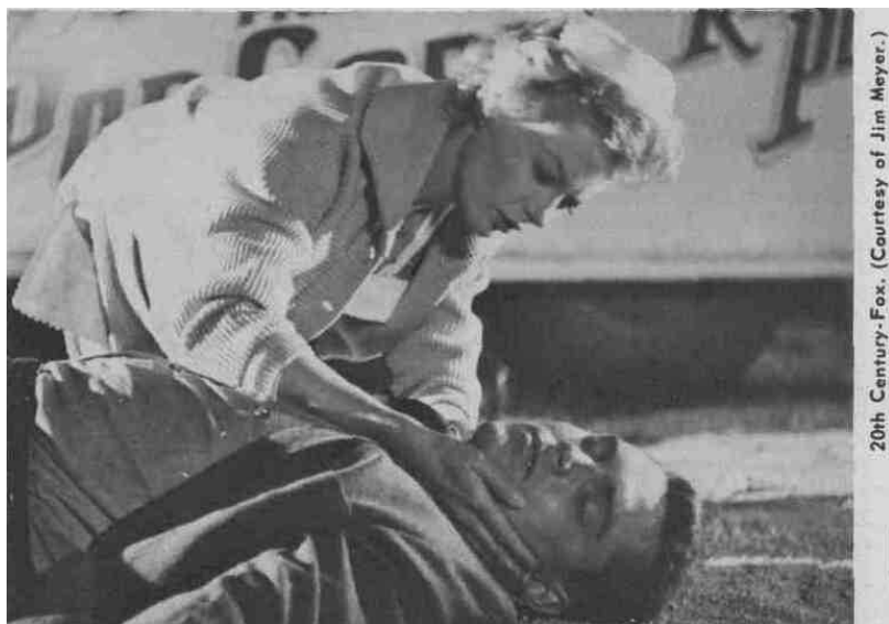
20th Century-Fox. (Courtesy of Jim Meyer.)

convict on the trail of stolen gold. A kindly lawman (Sullivan) effects his regeneration, and black-and-white CinemaScope photography greatly enhanced a film that never won the attention it deserved.