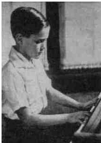
Age 8: Music was an early love of Jeff's

Through ability—and likability—Hank McKinnies was destined early to lead his own parade. Never, however, from any sense of fevered dedication. Just by constantly doing his best, as a scholar, artist and athlete. Later on, this was to puzzle other actors; they couldn't understand how he could be so well-adjusted and be an actor. Nor could they understand why he wanted to act, since he had none of their own fevered