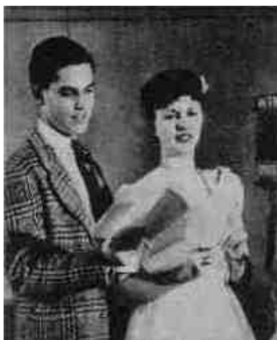
At 16: A high school hero and award winner