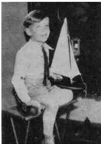
Age 5 : Life at home centered around him