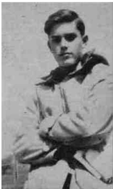
Age 14: He always had some project going!