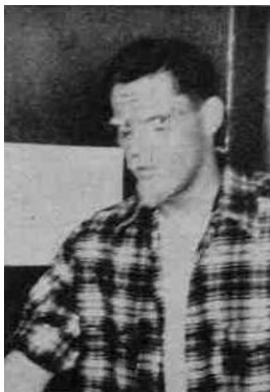
At Northwestern, yen to act "sort of grew"

later on. And he would not have blamed himself for "failing."