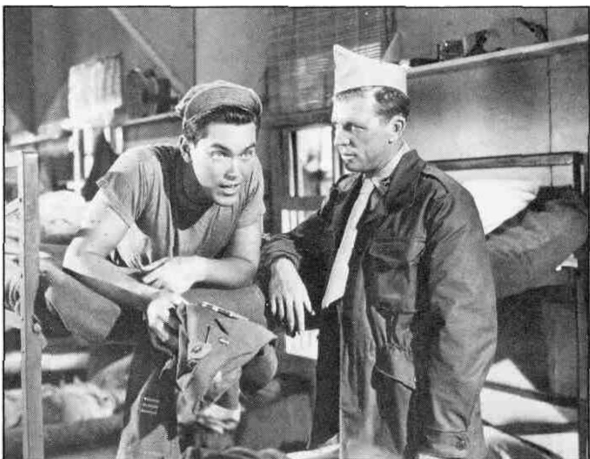
He shares a scene with Dan Dailey in Call Me Mister.

And though he never hit superstardom in his cut-short life (he died May 27, 1969 at the age of 41), he left behind a pretty strong list of solid, believable, convincing performances that garnered more critical ayes than nays over the eighteen years.