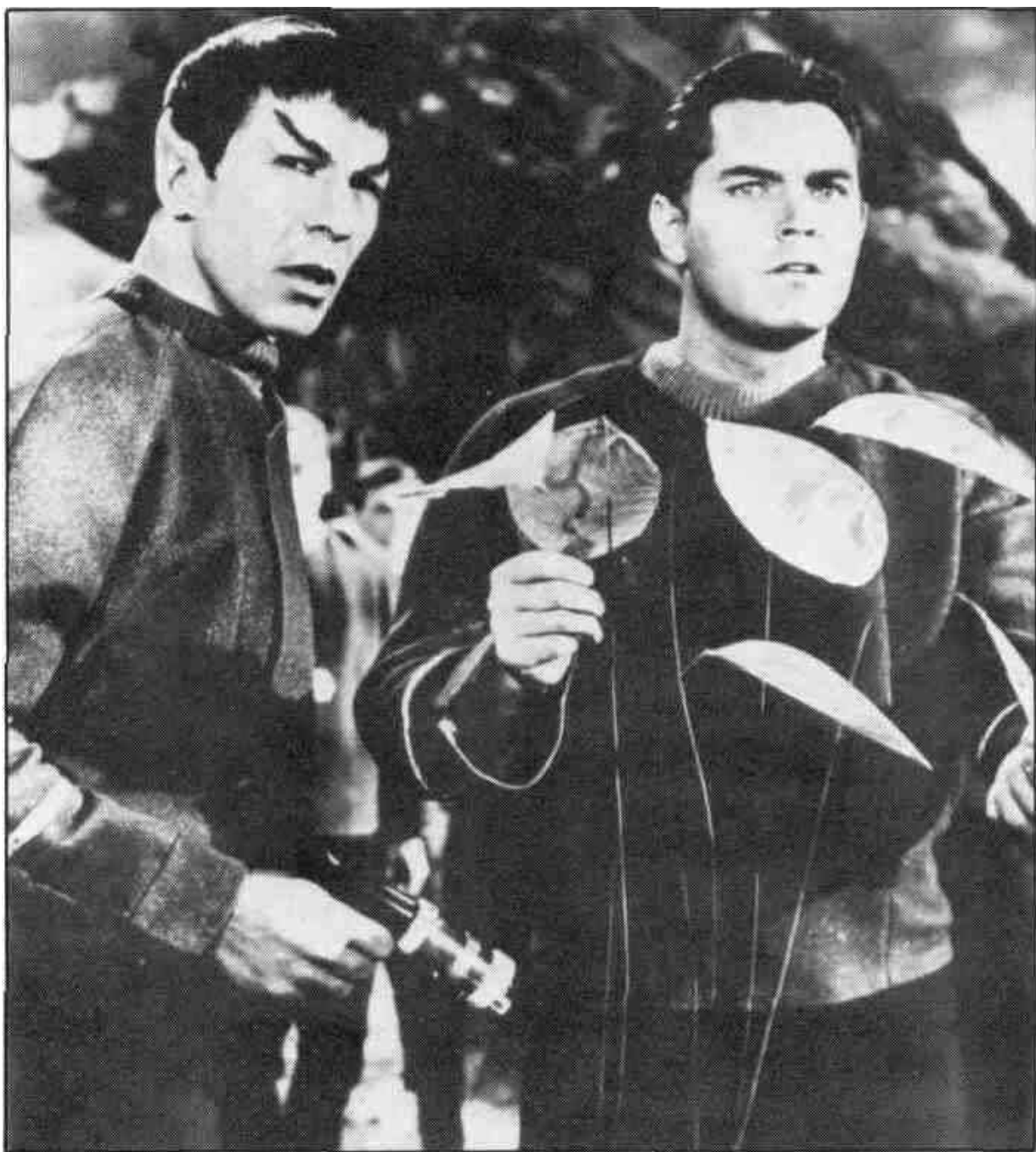
Hunter and Leonard Nimoy on an alien planet in an episode of Star Trek.

Bang Bang in London, were engaged and had set the date. But the date was not to be, for as Hunter once said, referring even to high school romances, "I've always gone for brunettes."