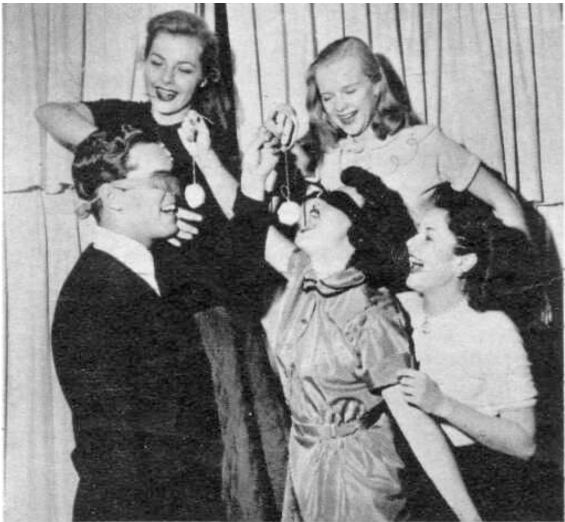
What now? Looks like peeled apples to us, but with this happy-go-lucky group one never can tell. Onions? Oh, we doubt it.