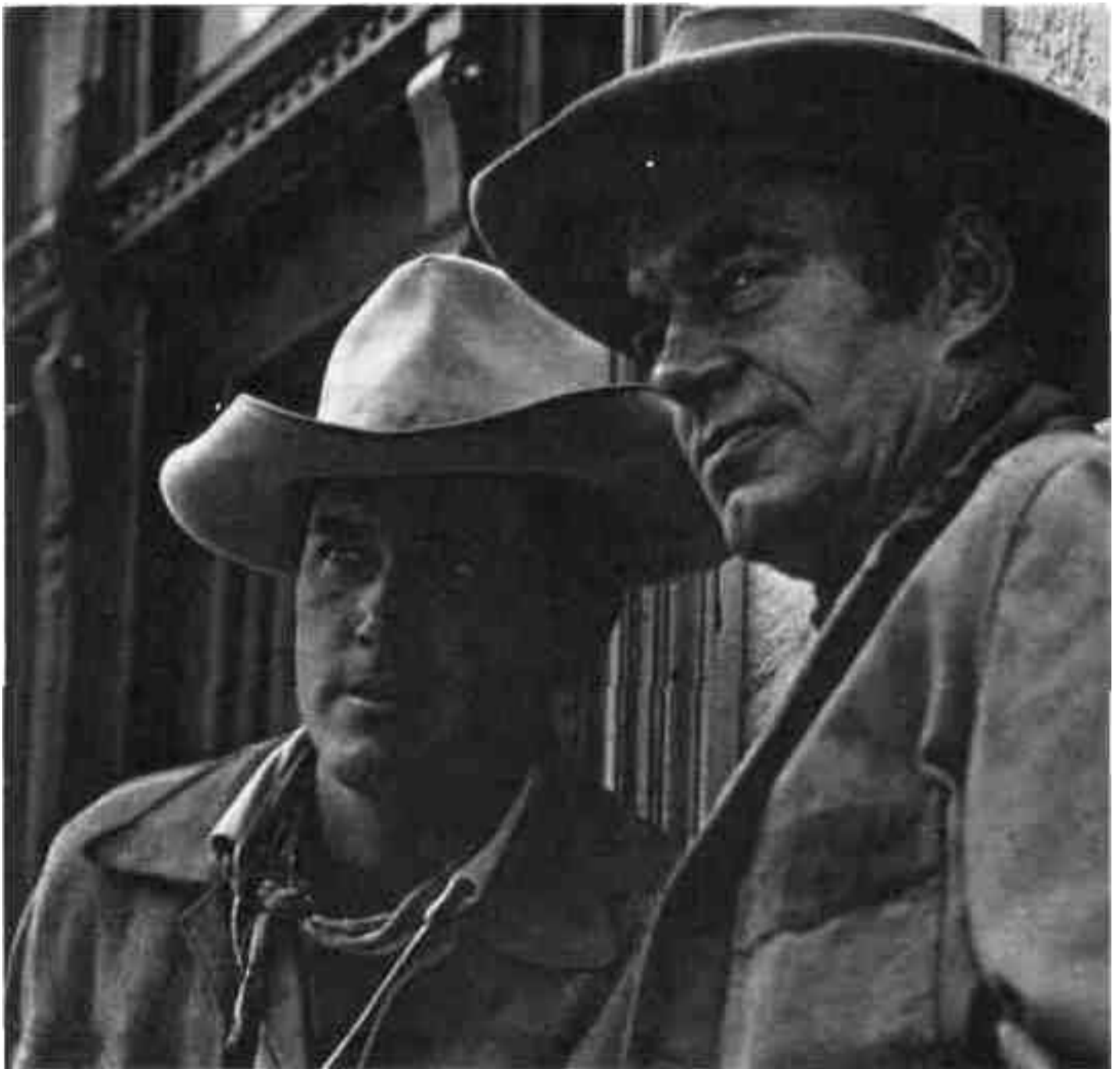
ABOVE: JEFFREY HUNTER WITH JACK ELAM IN A SCENE FROM THEIR SHORT LIVED "TEMPLE HOUSTON" TV SERIES.

In 1964 Jeff's own production company put together the series "Temple Houston" based on the life of Sam Houston's lawyer son. It was projected for 1964-65 but got an earlier airing when NBC wanted it to fill the gap of another cancelled series. Unfortunately, this series didn't last long either. It did last long enough though for an interesting article on Hunter to appear in the January 11, 1964 issue of TV GUIDE for those collectors in the audience.