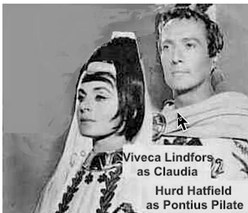
Viveca Lindfors as Claudia