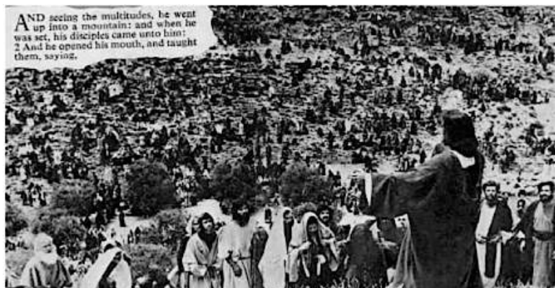
Robert Ryan as John the Baptist

AND seeing the multitudes, he went up into a mountain: and when he was set, his disciples came unto him: 2 And he opened his mouth, and taught them, saying,