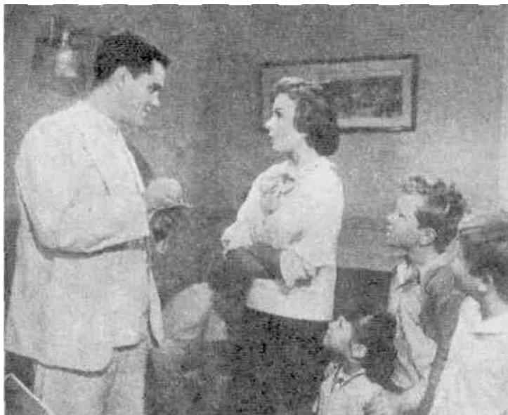
In "Belles on Their Toes," he's with Jeanne Crain. He was with her before in "Take Care of My Little Girl."

He plucked his name out of the blue one day, while walking across the 20th Century-Fox lot in response to a request from the higher-ups. Apparently they did not think his own name, Henry H. McKinnies, Jr. was suited to a movie marquee. For some lime thereafter, you could call "Jeff" or "Hey, Hunter!" after him, and get no response. The new name was hard to get used to. But so was it hard to get used to the idea that he was actually a movie actor!