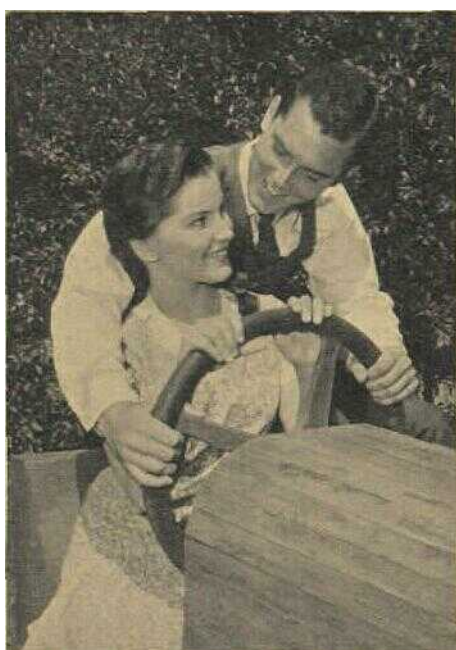
It's a wooden pedal car for Debra Paget and Jeff Hunter in Belles on Their Toes

The tall young man in the faded terry-cloth bathrobe was wiping make-up industriously from his face in the stuffy confines of the college auditorium dressing room when it happened.