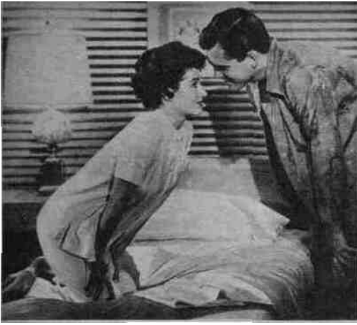
Adam and Maeve (Jeffrey Hunter and Dianne Foster) were as happy as could be—until Adam got involved in Uncle Frank's political campaign.

• A bomb hitting the city would have raised less dust than my Uncle Frank Skeffington's speech, that night on television. Not a set in town wasn't tuned in on his oratory accepting the nomination.