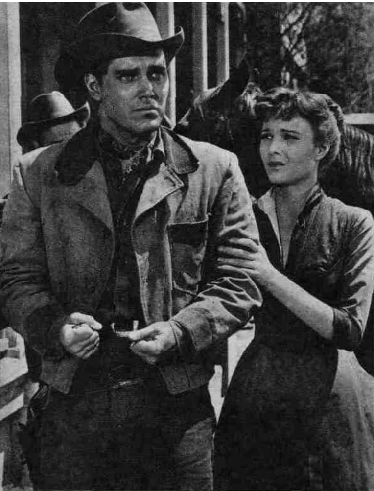
Bless loved Aud—but she was promised to Will, so Bless couldn't speak up.

Gentle-raised, Hannah Keough hated the hard life of Texas with a savage kind of hatin'. It fixed itself first on her man. She'd blamed Minor bitter for bringin' her out from the civilized East. When Minor died, she switched her resentment onto poor Will's wide shoulders. Young Hade she had no love for either. She hadn't wanted (continued on page 64)