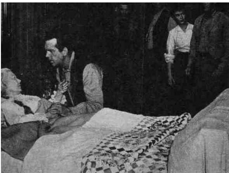
Bless was Ma's pet. Day Ma died, Will kept sayin', "I love ya, too, Ma!"

Jest 'cause a man's shy of fightin' don't mean he's less a man. Least that's what Bless proved