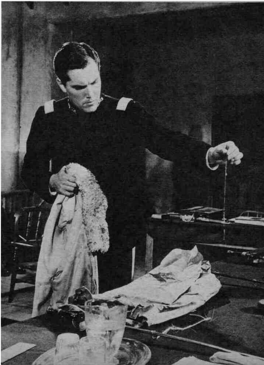
V As defense counsel, Cantrell knew the whole case depended on identifying the gold cross.