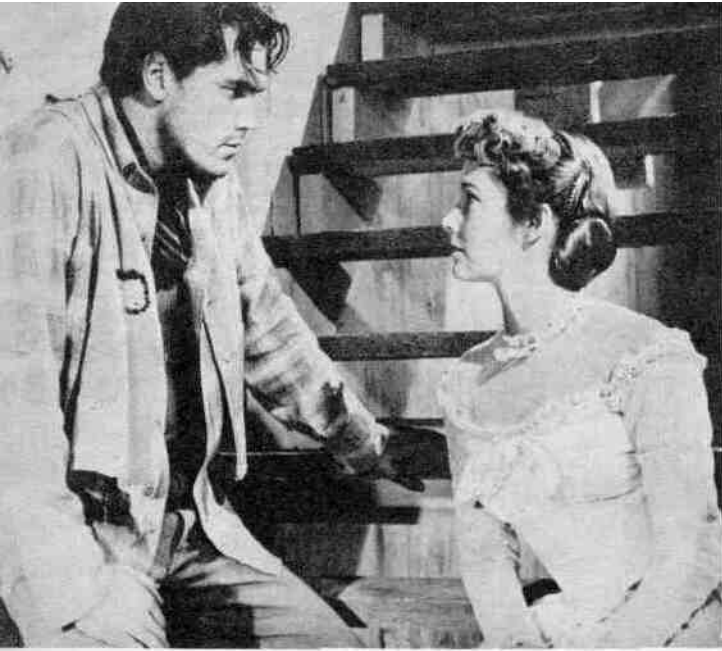
Martin begged Laurie (Vera Miles) to call off this wedding, to wait and marry him after he'd found his sister. But Laurie knew the search for Debbie was endless, "I'm not cut out for an old maid," she said.