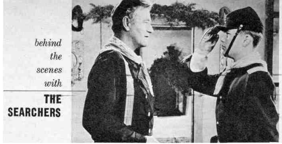
Duke Wayne's son Pat played a young cavalry lieutenant in the movie.

Then, seeing something beyond his shoulder, she did scream: "Martin!" He whirled, and Scar stood there inside the entrance with his scalping knife lofted. Martin's gun barked before the arm could sweep down, and two bullets ripped into the Comanche.