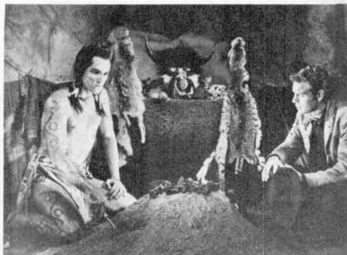
11. Hours later Appearing Day sought out Josh, imploring him to go to Little Dog, son of the chief. Josh went. He found Little Dog in the lodge of the medicine man. To his own suggestion that the south might be a better place to live, Little Dog cried, "Then let the white men go south!"