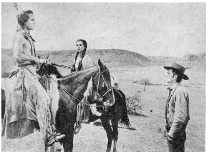
17. "Little Dog, hear me!" It was Appearing Day, riding in where no woman belonged. "He did not take me! It was I who came to him!" Slowly the tenseness left Little Dog. Once more he saw Josh as a brave friend. For the benefit of his tribesmen he leaned over and shook hands. And also for the benefit of his tribesmen he charged.