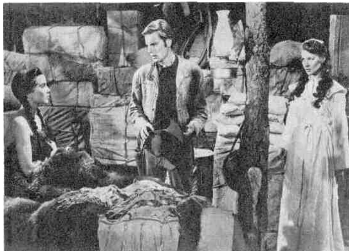
13. The situation was further complicated when Appearing Day, ignoring the 200 horses that American Horse was about to pay for her as a wife, appeared at the fort and trustingly placed herself in Josh Tanner's hands. "Don't go through with this unless you mean it," advised Ann Magruder, concealing her own feelings for Josh. "I know what it is like to be hurt."