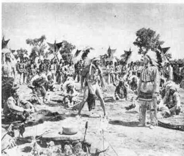
10. First to spring to his feet was Little Dog, son of Broken Hand. "It is better if my white brother goes," he cried. "Things must now be said that cannot be said before him." As Josh left, he could hear the warriors shouting that Broken Hand betrayed them; now they would never make peace.