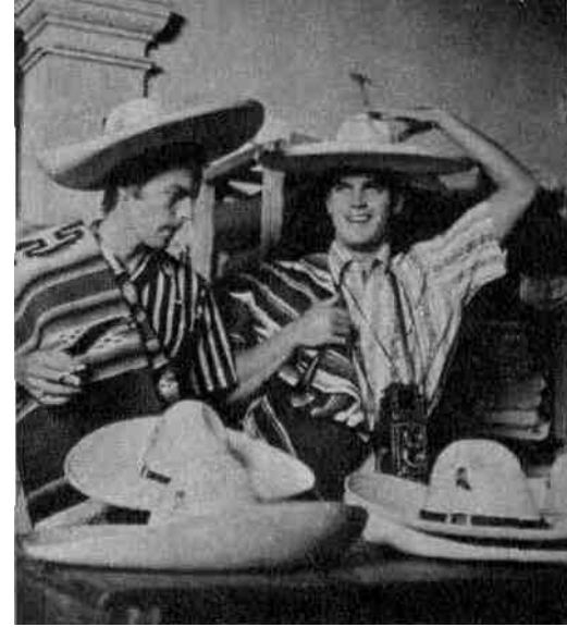
The boys go native; buy sombreros, but skip the gay sarapes