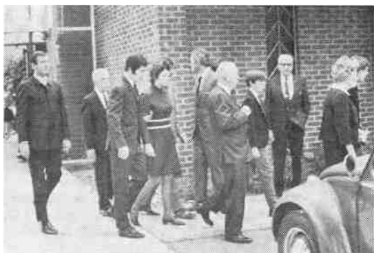
Emily (c.) and Jeff's parents (front) after services.